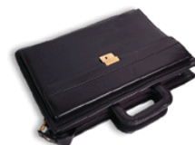
This year all Committee Chairs were issued these nifty brief cases.