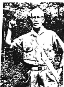
Left: A picture of E. Urner Goodman

"The Order of the Arrow is a thing of the spirit rather than of mechanics. Organization, operational procedure, and paraphernalia are necessary in any large and growing movement, but they are not what count in the end. The things of the spirit count..."